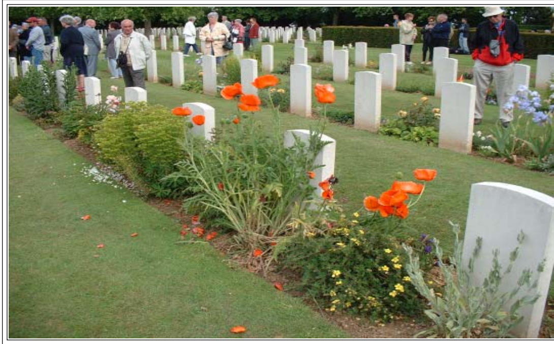
Canadian War Cemetery Beny-sur-Mer