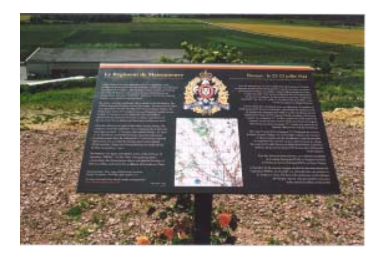
Plaque of the Régiment de Maisonneuve, unveiled 8 June, 2003

ACCOMMODATION IN NORMANDY IS BEING BOOKED VERY RAPIDLY. If you are planning to go, make your reservations NOW.